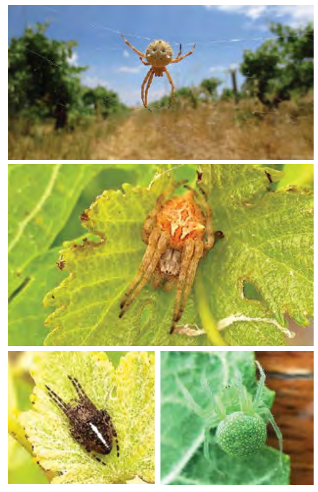
Figure 68 Garden orb-weaver, Eriophora species – hanging between grapevine rows (top), and on grapevine (middle).

contribute to the control of flying pest insects, as well as a range of other arthropod pests, including scale insects (Thomson et al. 2007).