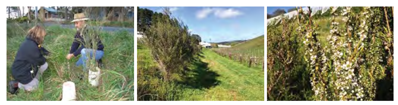
Figure 3 Prickly tea-tree, Leptospermum continentale, during establishment (left), shrubs established as a shelterbelt (centre), and the pollen and nectar producing white flowers (right).