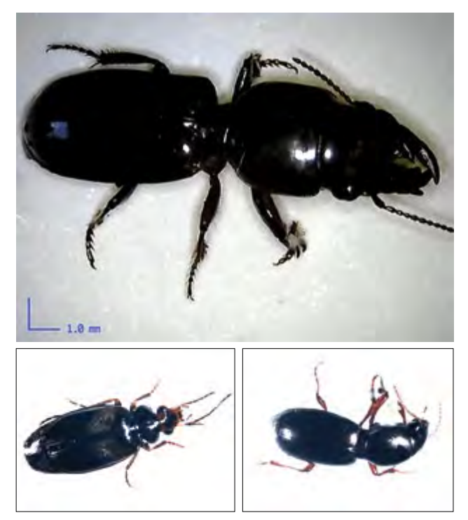
Figure 21 Ground beetle, Geoscaptus species (top).

Breeding cycle : eggs are laid in the soil, leaf litter or rotting wood. The larvae pass through three stages before pupation. Adult ground beetles can live from one to four years.