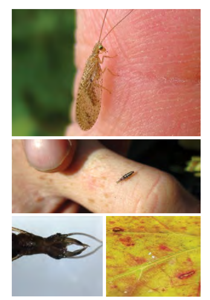
Figure 55 Adult brown lacewing, Micromus tasmaniae (top); brown lacewing larva (middle).

Significance to viticulture : brown lacewings are important biocontrol agents of light brown apple moth (LBAM), soft scale and mealybugs (Bernard et al. 2006b). They will be more likely to establish if there is a refuge of suitable nectar producing trees and/or shrubs nearby.