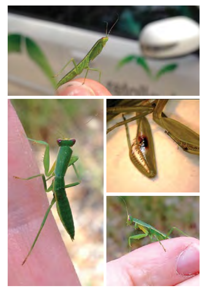
figure 61 Praying mantises (top) and (middle left and bottom right).

Breeding cycle : they normally live for about a year. In cooler climates, the adults lay eggs in autumn, then die. The eggs are protected by their hard capsules, and hatch in spring