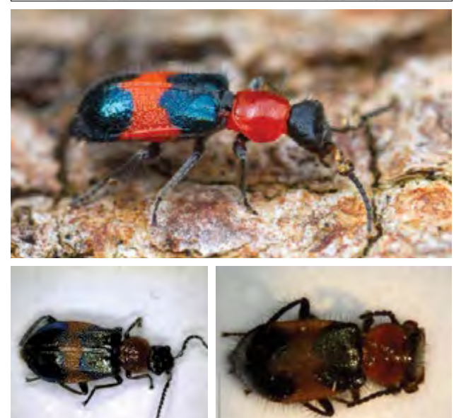
Figure 35 Female red and blue beetle, Dicranolaius bellulus (top).

Figure 36 Female red and blue beetle, Dicranolaius bellulus (middle).