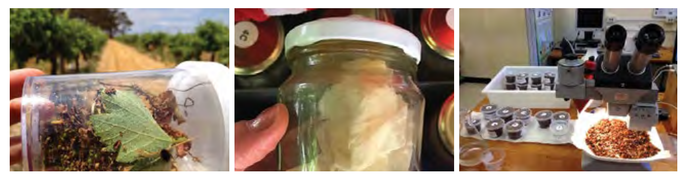
Figure 6 Captured arthropods in a plastic container (left), a euthanising jar (centre), arthropod samples are sorted from plant debris and then identified (right).

Captured arthropods can be viewed non-destructively by looking through the clear plastic storage containers. Alternatively, they can be transferred to a freezer or a euthanising jar, so that they can then be identified under a microscope (see Figure 6).