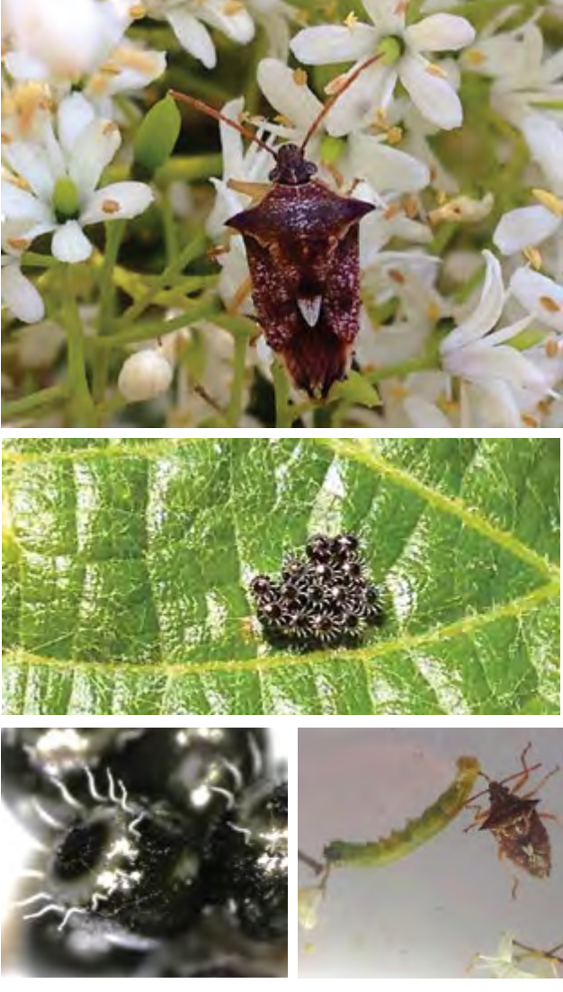
Figure 16 A predatory shield bug, Oechalia schellenbergii, on flowering Christmas bush (top); a raft of eggs on a grapevine leaf (middle).

Sensitivity to sprays: predatory bugs are particularly sensitive to carbaryl, methomyl, fipronil, indoxacarb, organophosphates, pyrethroids and spinosad (Thomson 2012). Residues on foliage, or in plant tissues, may remain toxic to predatory bugs for many months (Biological Services 2019).