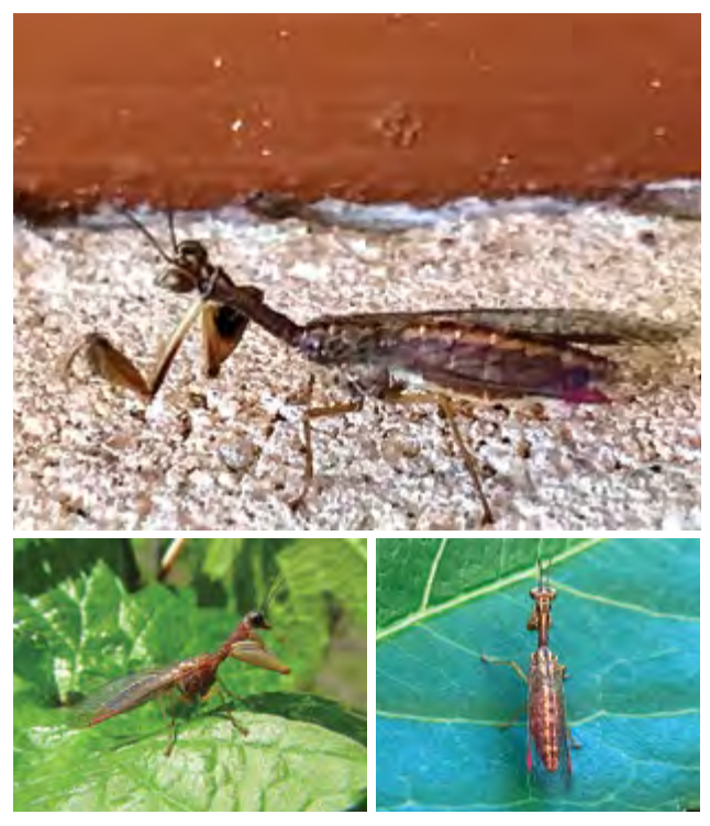
Figure 57 A mantid lacewing (top). Figure 58 Mantid lacewings on grapevine (bottom).]

Sensitivity to sprays : pesticides are toxic to lacewings; and some fungicides may be disruptive. Chlorpyrifos can persist in toxicity for up to eight weeks; and along