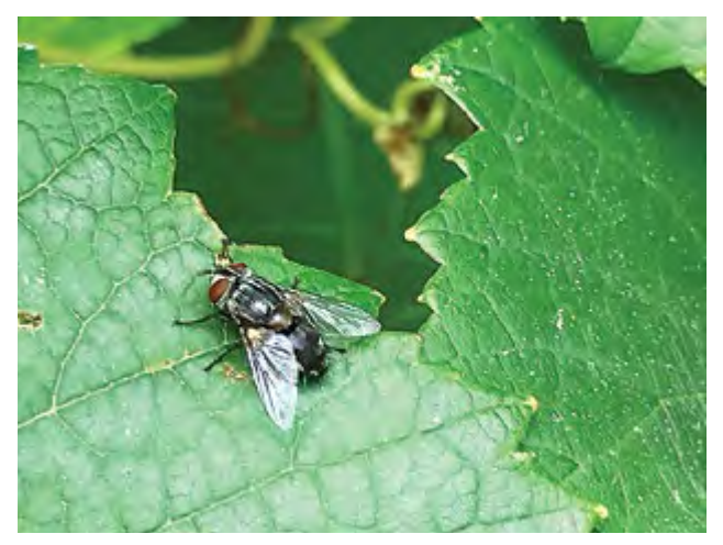
Figure 44 Tachinid fly on grapevine.

Breeding cycle : some tachinid flies lay their eggs directly on their hosts, which then hatch and penetrate their victims. Others lay their eggs on the host's food plants, which are then consumed along with the plant. Once inside, the eggs hatch within their host, and the larvae penetrate the gut wall. The larvae have three moults before they pupate.