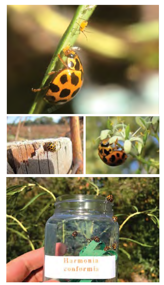
Figure 31 Common spotted ladybird beetle, Harmonia conformis, and shown consuming aphids (top).

Sensitivity to sprays: collateral damage will occur to ladybird beetle populations if broad-spectrum insecticides are used. Ladybird beetles are particularly sensitive to high rates of sulphur (≥400 g/100 litres), carbaryl, methomyl, indoxacarb, organophosphates and pyrethroids (Thomson 2012). Growth regulators such buprofezin are also toxic (Thomson et al. 2007). Residues of some chemicals on foliage may remain toxic for many weeks and negatively impact on ladybird beetle survival (Biological Services 2019).