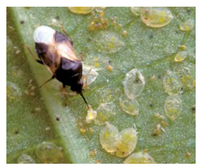
Figure 11 A minute pirate bug.

Development time from egg to adult can vary from 16 to 18 days at 25°C. Females lay an average of two to three eggs per day and live for three to four weeks.