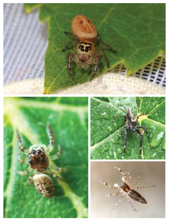
Figure 72 Jumping spiders on grapevine (top and bottom left).

Sensitivity to sprays : collateral damage to spider populations will occur if broad spectrum insecticides are used. Spiders are particularly sensitive to mancozeb (Thomson et al. 2007), carbaryl, methomyl, organophosphates and pyrethroids (Thomson 2012).