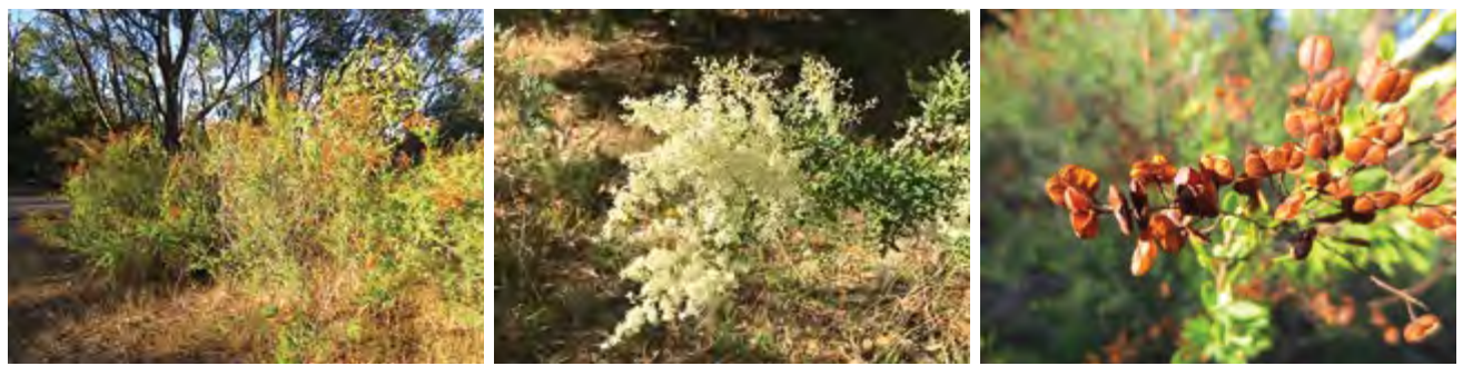
Figure 1 Christmas bush, Bursaria spinosa, exhibits a natural sprawling habit (left), small creamy coloured flowers that provide pollen and nectar (centre), and distinctive seed pods (right). Images: Mary J Retallack

The opportunity to plant selected native insectary species could help winegrape growers save time and resources by producing fruit with lower pest incidence, while enhancing the biodiversity of their vineyards and properties.