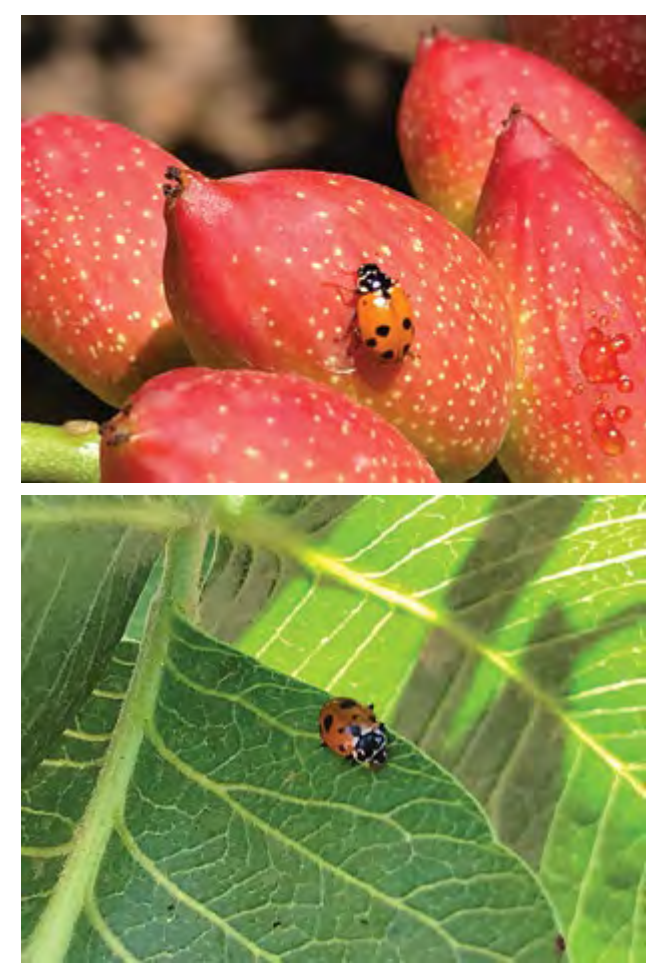
Figure 34 Spotted amber ladybird beetle, Hippodamia variegata, on pistachio (top and bottom).

Sensitivity to sprays : collateral damage will occur to ladybird beetle populations if broad-spectrum insecticides are used. Ladybird beetles