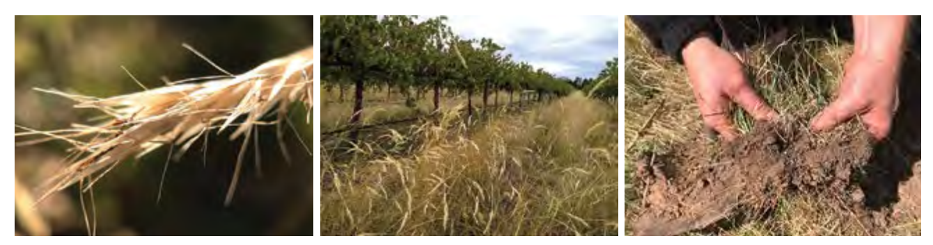
Figure 2 Wallaby grasses, Rytidosperma species, seed head (left), planted as a mix of species in the vineyard mid-row (centre), and the underground biomass produced by the roots (right).