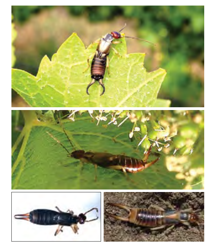
Figure 59 Male European earwigs, Forficula auricularia, on grapevine (top) and (middle).

Significance to viticulture : the European earwig is an important omnivorous predator of light brown apple moth (LBAM) in vineyards (Frank et al. 2007). They may cause