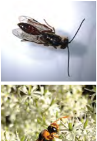
Figure 51 Vespoid predatory wasp (top right); 'orange potter wasp', Eumenes latreilli, a vespoid predatory wasp, on Christmas bush (bottom right).