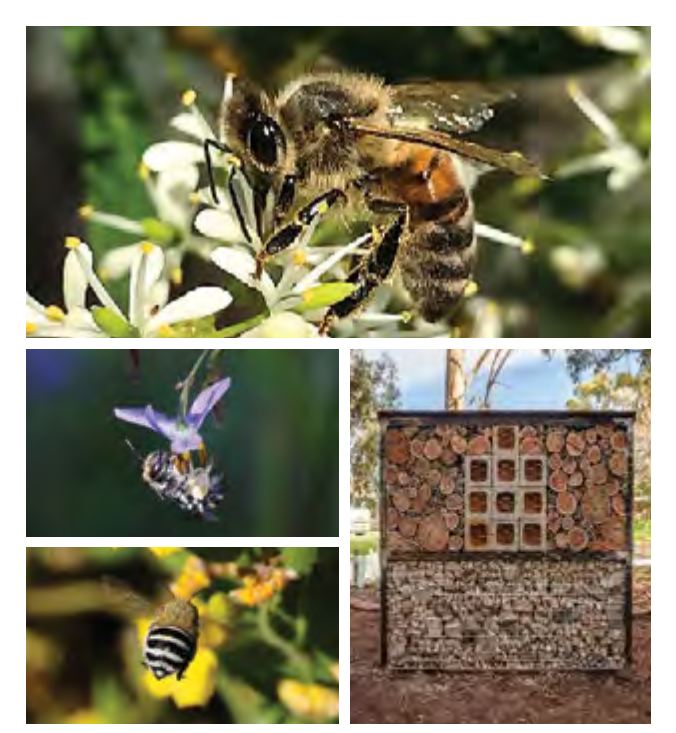
Figure 80 Honey bee on Christmas bush (top); native nomia bee, Lipotriches (Austronomia), foraging a native lily (middle left).

Buzz pollination : some native bees use a special pollination technique called 'buzz pollination'. The 'blue-banded bee', for example, bangs its head on the flower's anthers 350 times a second to release the pollen (Switzer et al. 2016)!