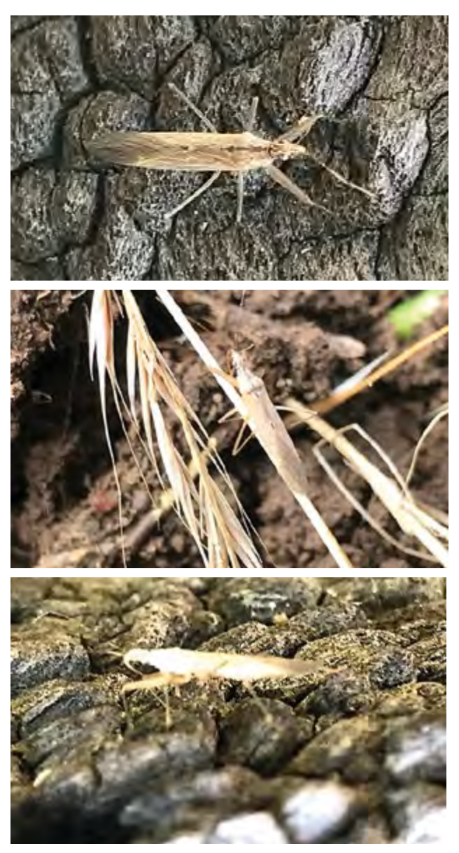
Figure 13 A Pacific damsel bug, Nabis kinbergii (top), and camouflaged against a dry grass plant stem (middle)

Sensitivity to sprays : predatory bugs are particularly sensitive to carbaryl, methomyl, fipronil, indoxacarb, organophosphates, pyrethroids and spinosad (Thomson 2012). Residues on foliage, or in plant tissues, may remain toxic to predatory bugs for many months (Biological Services 2019).