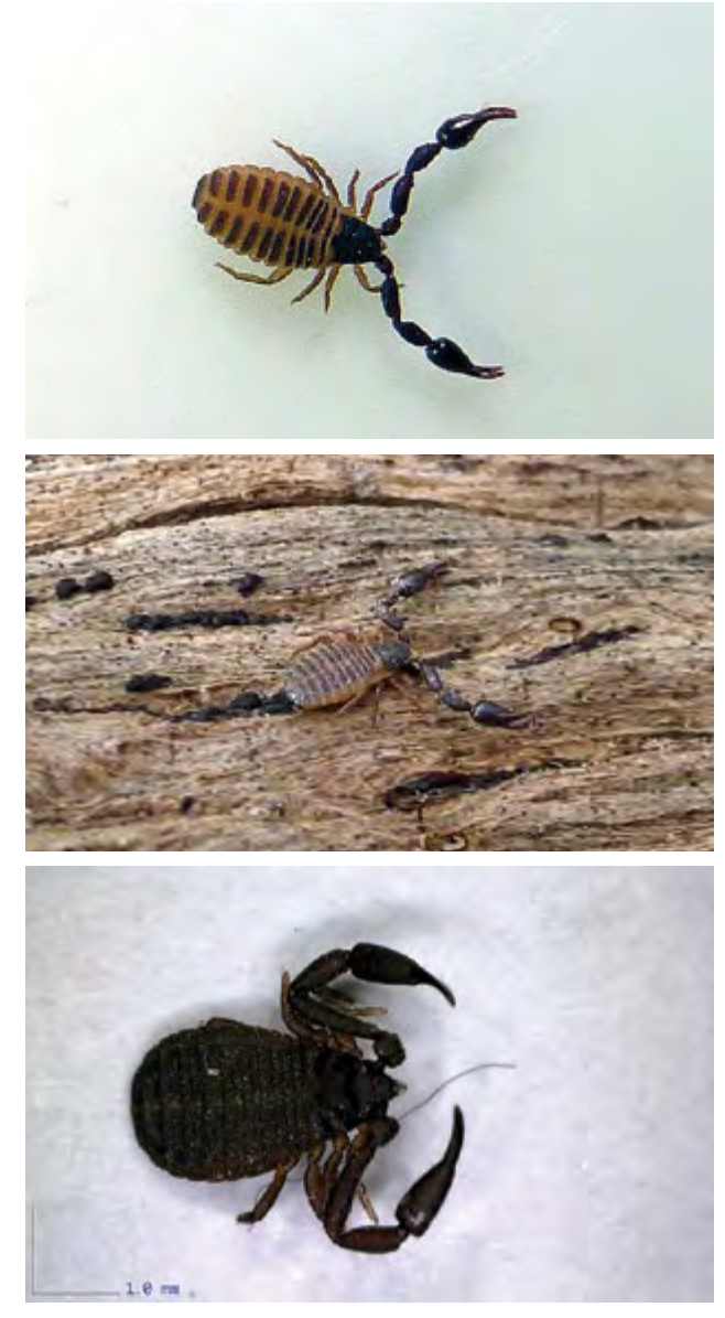
Figure 78 False scorpions (top and middle).

Sensitivity to sprays : collateral damage to false scorpion populations will occur if broad spectrum insecticides are used.