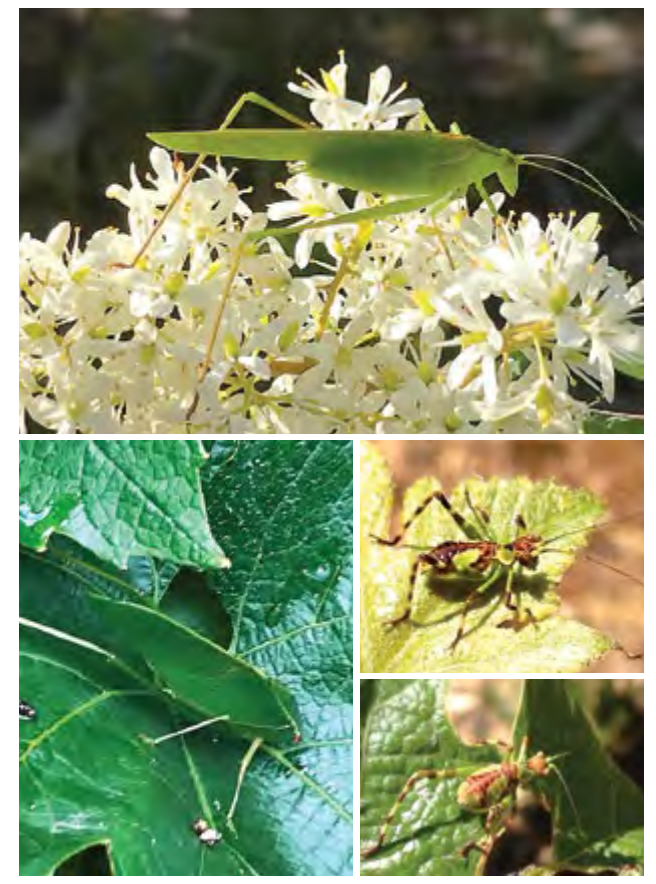
Figure 63 Adult katydid on grapevine (bottom left), and on Christmas bush (top).

Significance to viticulture : some species of katydids are predators of insect pests and their eggs.