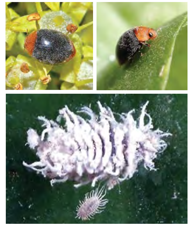
Figure 27 Cryptolaemus montrouzieri, mealybug-destroyer ladybird beetles (top).

Significance to viticulture: Cryptolaemus are a very efficient natural enemy of light brown apple moth (LBAM) caterpillars and eggs, mealybugs, and scale insects (Bernard et al. 2007; Thomson et al. 2007).