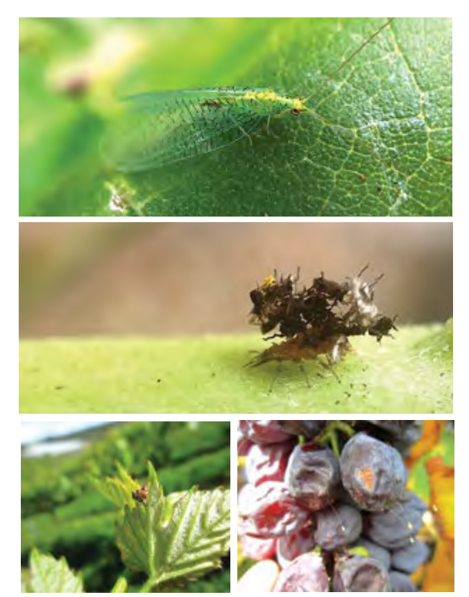
Figure 53 Adult green lacewing, Mallada signata, on grapevine (top); a 'junk bug' – a green lacewing larva with remnants of dead prey attached to small spines on its back (middle).

Significance to viticulture : green lacewings can be purchased from commercial suppliers for release as biocontrol agents of light brown apple moth (LBAM), soft scale and mealybugs (Bernard et al. 2006b). They will be more likely to establish if there is a refuge of suitable nectar-producing trees and/or shrubs nearby.