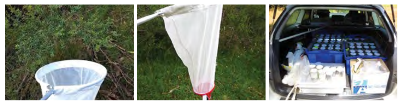
Figure 5 Foliage is placed inside the modified sweep net (left), the captured arthropods fall to the bottom of the net (centre), and can then be immobilised in the field and placed in storage containers (right).

Arthropods found in association with native insectary shrubs can be collected by firmly shaking the foliage inside an insect sweep net, which has been modified to hold a funnel and a collection container. Collected arthropods can then be immobilised in the field if required. (See Figure 5).