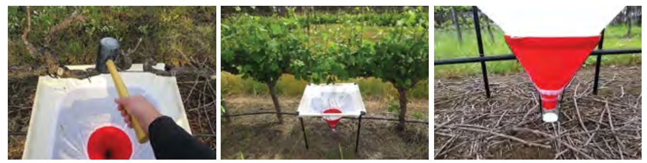
Figure 4 A rubber mallet is used to strike the cordon to dislodge the arthropods (left), the net is placed below the cordon (centre), and insects are collected in a plastic container positioned below the funnel (right).

Arthropod samples can be collected from grapevines by firmly striking the cordon with a rubber mallet over a beat net fashioned around a card table frame, which holds a funnel and plastic collection container (see Figure 4).