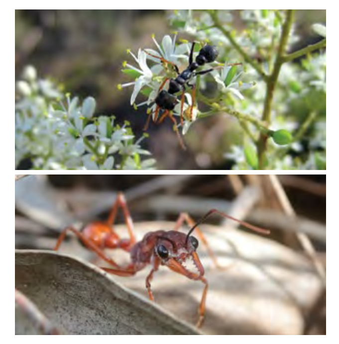
Figure 52 Jack jumper ant, Myrmecia pilosula, on Christmas bush (top); an ant in leaf litter on the ground (bottom).

Significance to viticulture : omnivore ants are generalist feeders of a range of pest species. Meat ants, Iridomyrmex species, are some of the few predators that will consume black Portuguese millipedes (Crawford 2015).