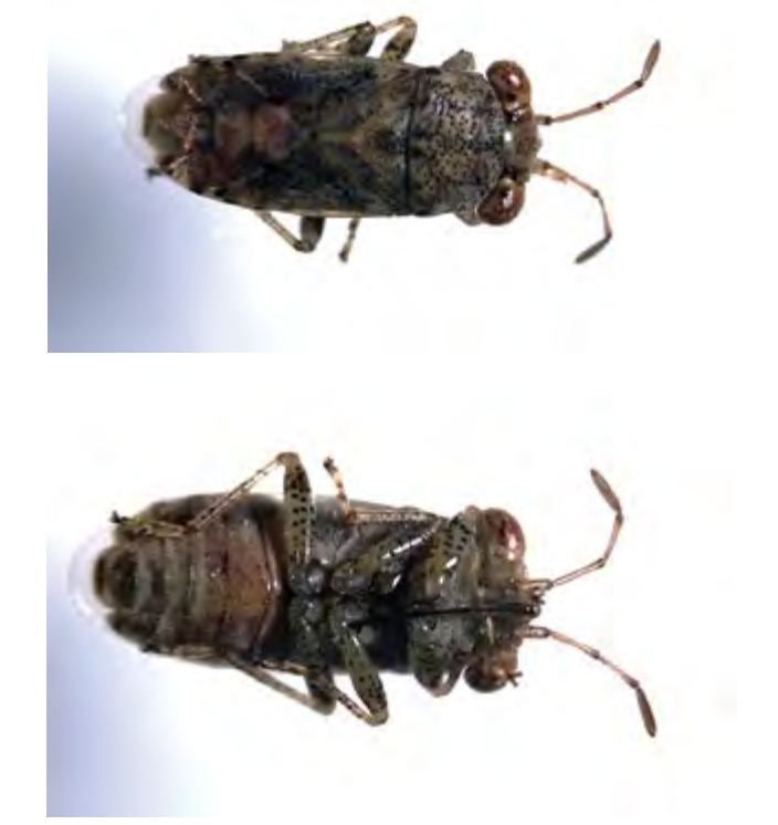
Figure 12 A top view (TOP) and an underside view (ABOVE) of a big-eyed bug, where the proboscis can be seen tucked under the body.

Sensitivity to sprays : predatory bugs are particularly sensitive to carbaryl, methomyl, fipronil, indoxacarb, organophosphates, pyrethroids and spinosad (Thomson 2012). Residues of some chemicals on foliage, or in plant tissues, may remain toxic to predatory bugs for many months (Biological Services 2019).