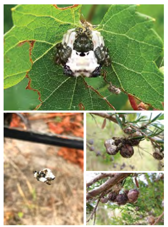
Figure 66 Adult bird-dropping spider on grapevine (top); adult bird-dropping spider hanging from a silken thread waiting for prey in a vineyard (bottom left).

Breeding cycle : females lay up to 13 egg sacs, with about 200 eggs in each, strung together with strong silk threads.