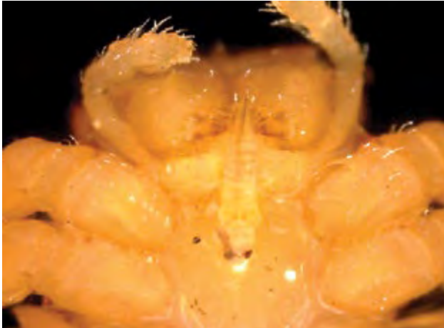
Figure 70 An adult triangular spider (top); a triangular spider eating a 'western flower thrips' (bottom).