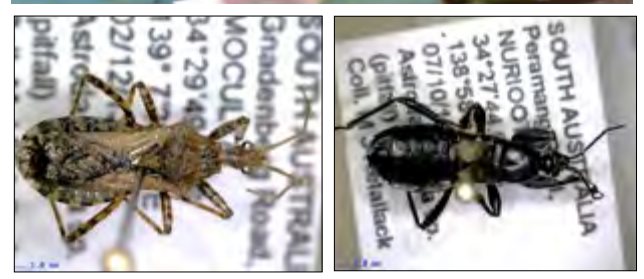
Figure 18 Orange assassin bug, Gminatus australis, on Christmas bush, Bursaria spinosa (top and middle). Images: Mary J Retallack

Figure 19 'Brown assassin bug', Coranus species (bottom left); 'black ground assassin bug', Peirates species (bottom right). Images: Mary J Retallack