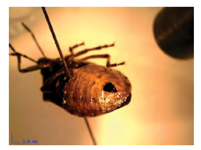
Figure 15 Glossy shield bug, Cermatulus nasalis (top), which can have a black dot on the underside of the abdomen (bottom)

Sensitivity to sprays: predatory bugs are particularly sensitive to carbaryl, methomyl, fipronil, indoxacarb, organophosphates, pyrethroids and spinosad (Thomson 2012). Residues on foliage, or in plant tissues, may remain toxic to predatory bugs for many months (Biological Services 2019).