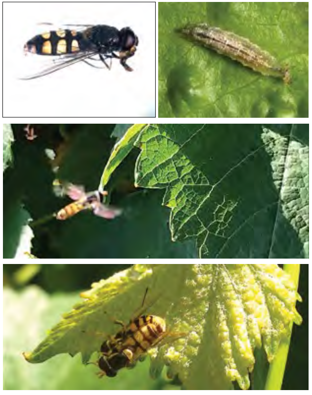
Figure 39 Hoverfly adult (top left) and larva (top right). Images: Mary J Retallack (left), Plant and Food Research NZ (right) Figure 40 A hoverfly, hovering in mid-flight (middle), and hoverflies mating (bottom). Images: Mary J Retallack

Breeding cycle : females lay white, oval-shaped eggs near prey, so the larvae don't have to go far to find food when they hatch after a few days. They remain larvae for about two weeks, and then pupate prior to emerging as adults. Development from egg to adult takes two to six weeks.