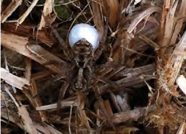
Figure 71 A 'garden wolf spider', Tasmanicosa species, eating a 'lynx spider' (top left); an especially well-camouflaged female 'garden wolf spider', Tasmanicosa godeffroyi, with an egg sac (bottom).