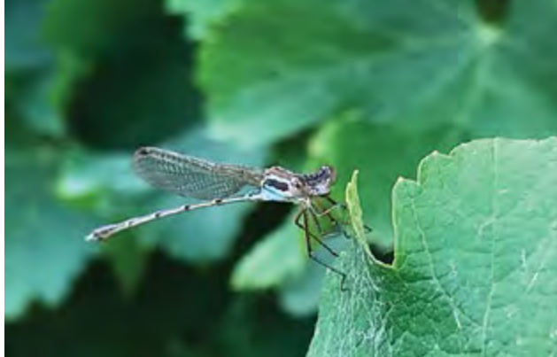
Figure 10 Damselflies on grapevine.